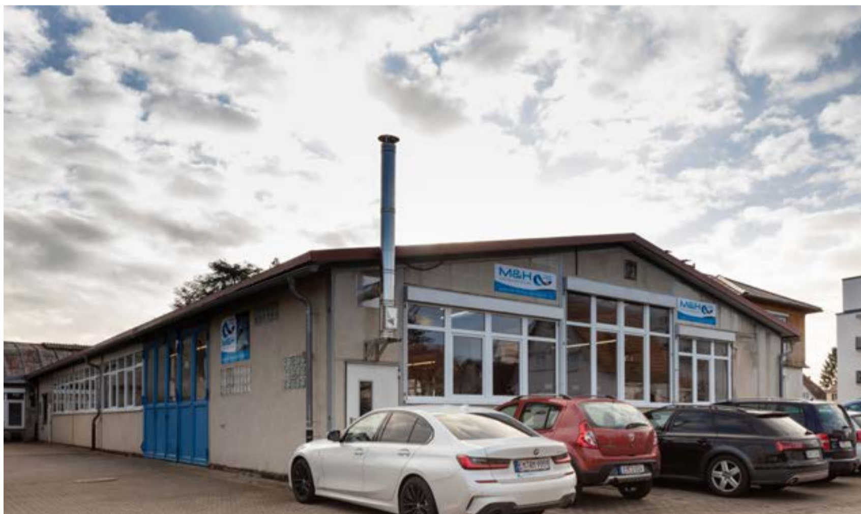
The production plant in Kenzingen